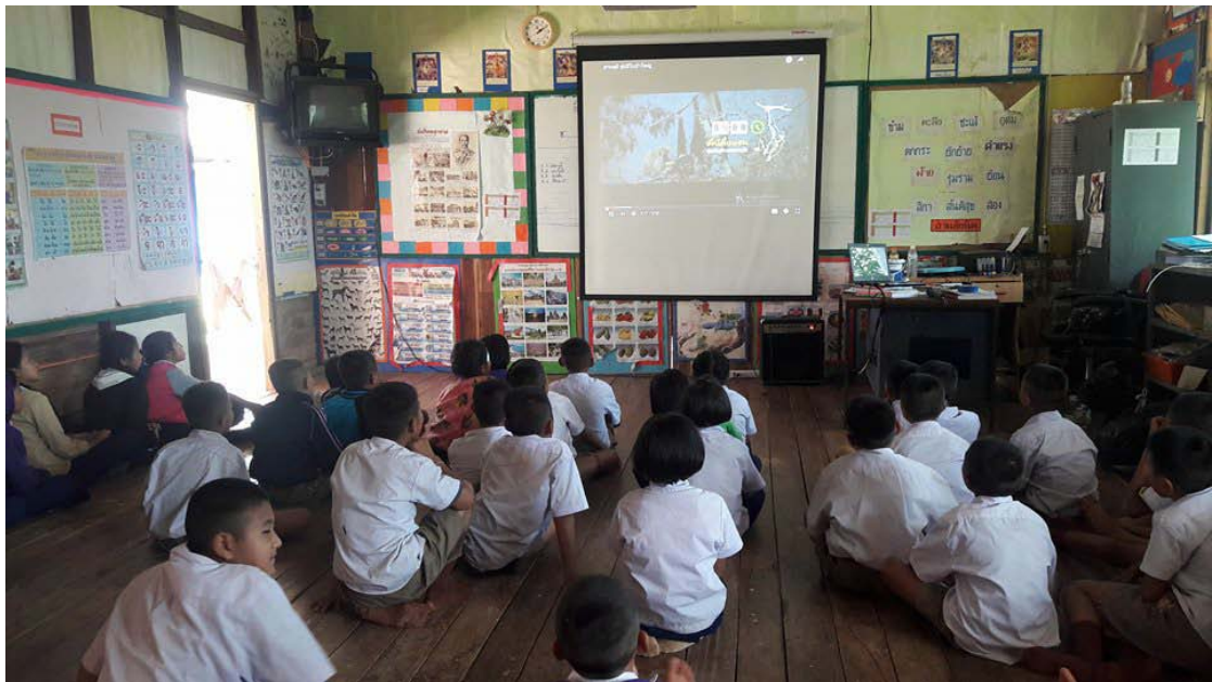
Fig. 2. Students learning about Lar gibbon