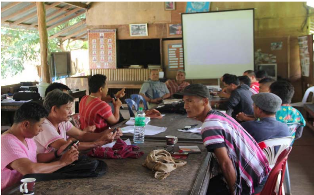
Fig. 8. Community Leaders Meeting to discuss Lar gibbon issues