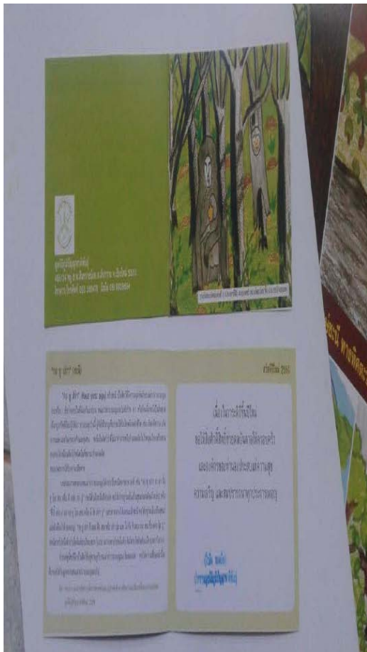
Fig. 10. Postcards distributed to border members and community leaders