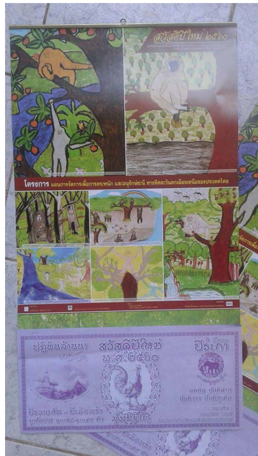
Fig. 11. 2017 Lars Gibbon calendar image, distribution to local communities