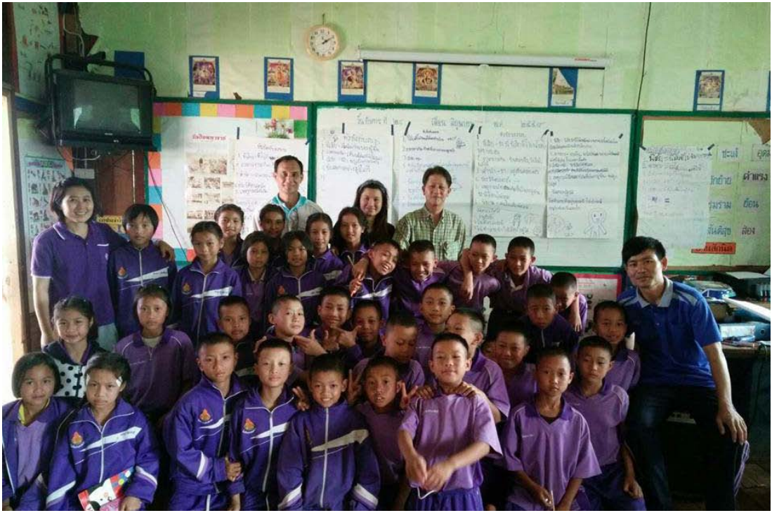
Fig. 1. Students and teachers who have learned about the Lar gibbon