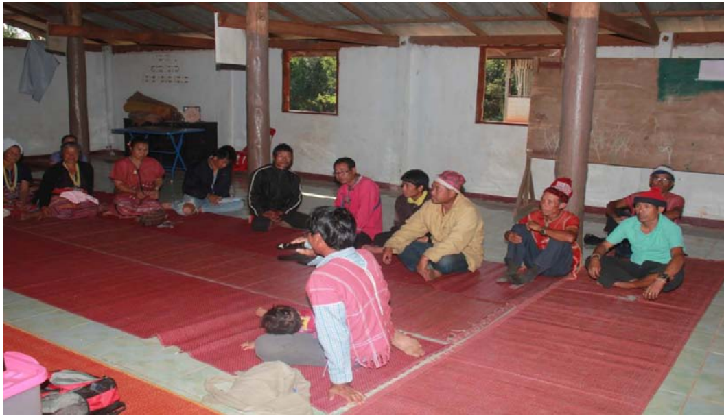
Fig. 9. Community member meeting to discuss Lar gibbon issues