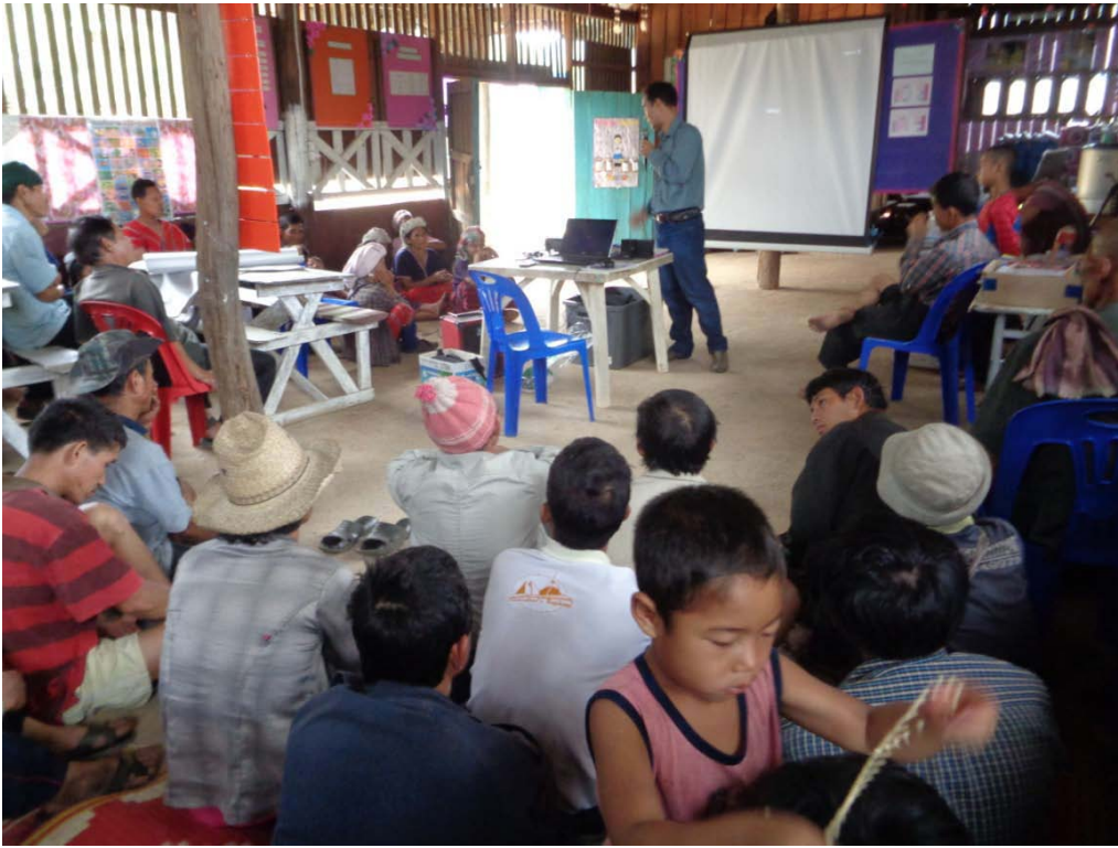
Fig. 7. Meeting with Community to discuss Lar gibbon issues