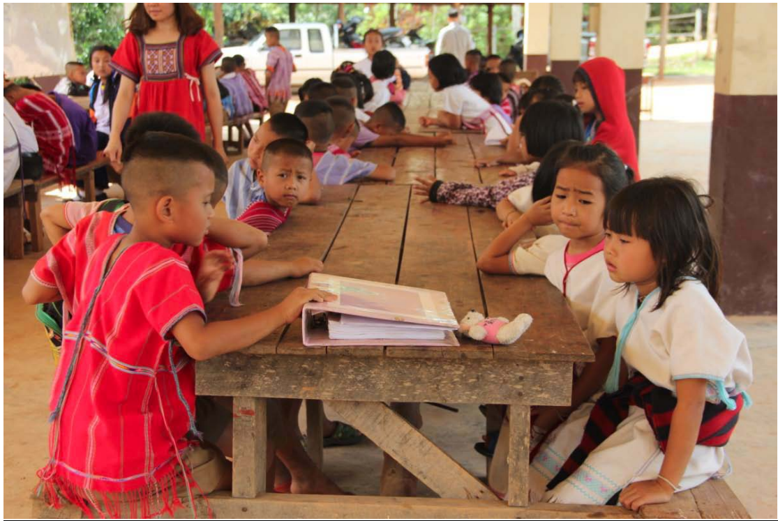
Fig. 6. Student waiting to eat after drawing Lar Gibbon pictures